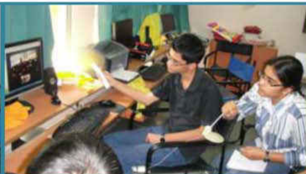
Skype Debate with Neston High School, UK