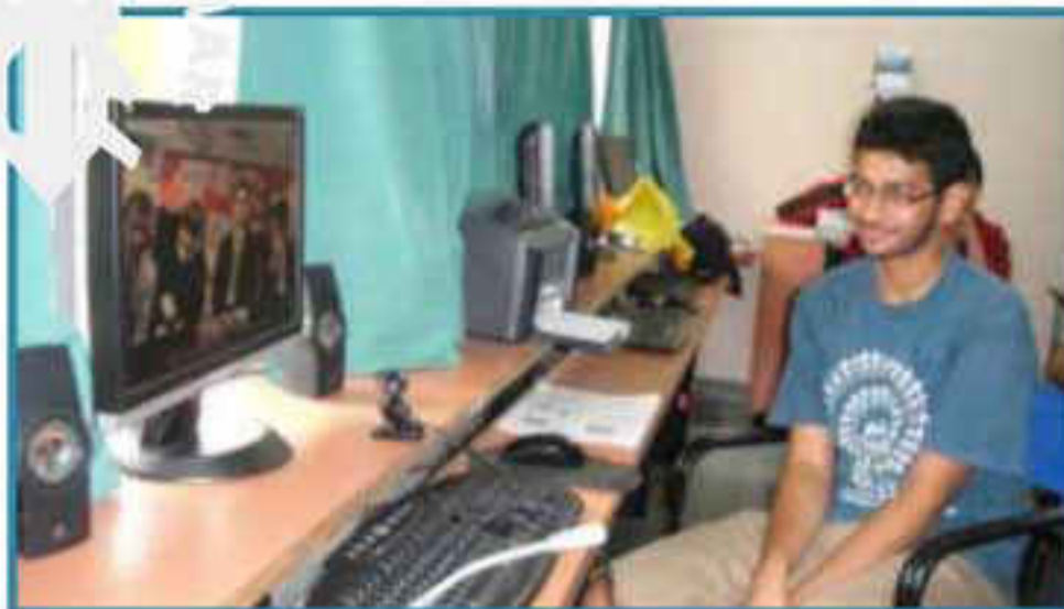
Skype debate with Mossland School, UK